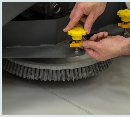
Serviceability: New maintenance free motor, high-quality gearbox and added yellow touch points