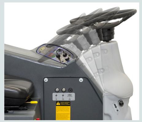
Tilt steering wheel for easy boarding, plus ergonomically designed operator compartment for safety and comfort