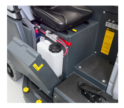
Ecoflex chemical kit (optional): easy accessible detergent cartridges