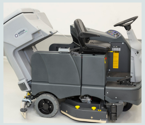
Tip-out and lift-off recovery tank