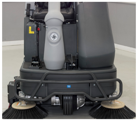
Dual side brooms (cylindrical models) deliver true edge cleaning

The exceptional Ecoflex system allows the operator to match the floor cleaning machine's performance to the soil on the floor and the required level of clean. When encountering more soiled areas of the floor, the operator can activate the "burst of power" button for extra cleaning performance, and as easily return to original settings for minimum usage of water, detergent and power. Green meets clean.